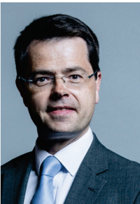
Rt Hon James Brokenshire MP

Secretary of State for Housing, Communities and Local Government